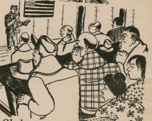
drawings by Mine Okubo