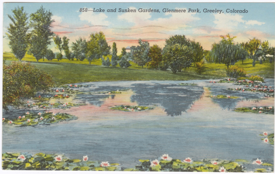
858—Lake and Sunken Gardens, Glenmere Park, Greeley, Colorado