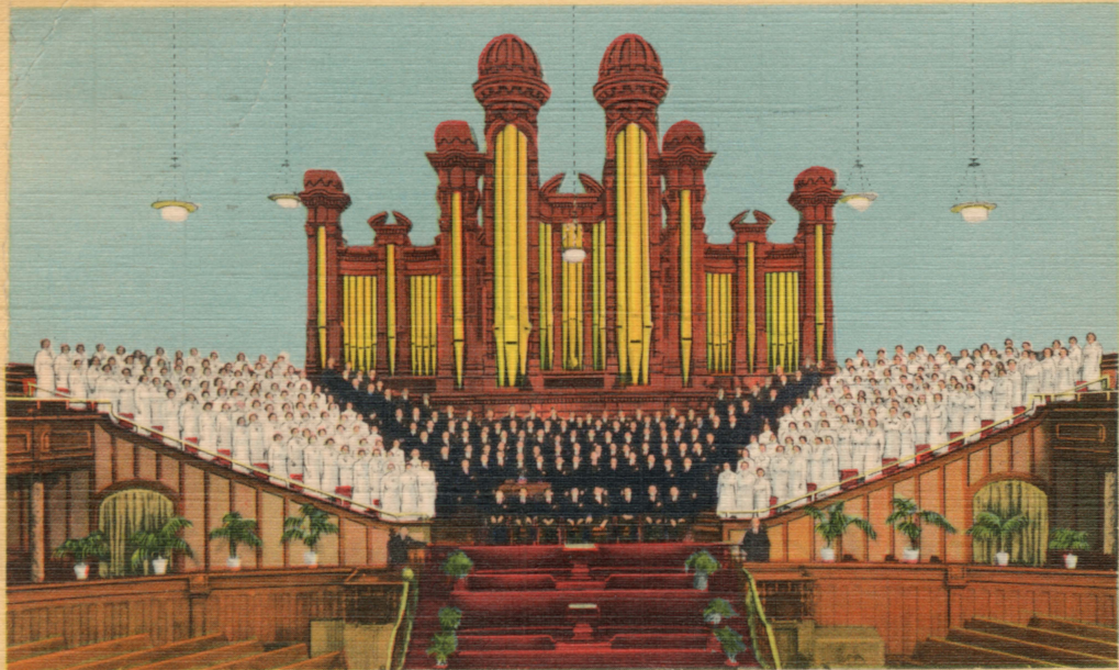
905 The Tabernacle Choir and Organ, Great "Mormon" Tabernacle, Salt Lake City, Utah