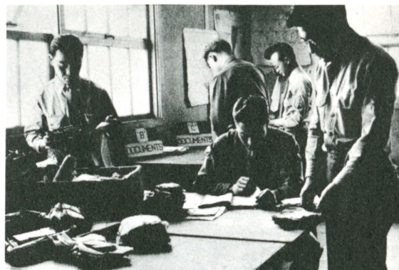
MIS Document Pre-scanning — 1942

MAJ GEN JACOB L. DEVERS CHIEF OF THE ARMY FIELD FORCES