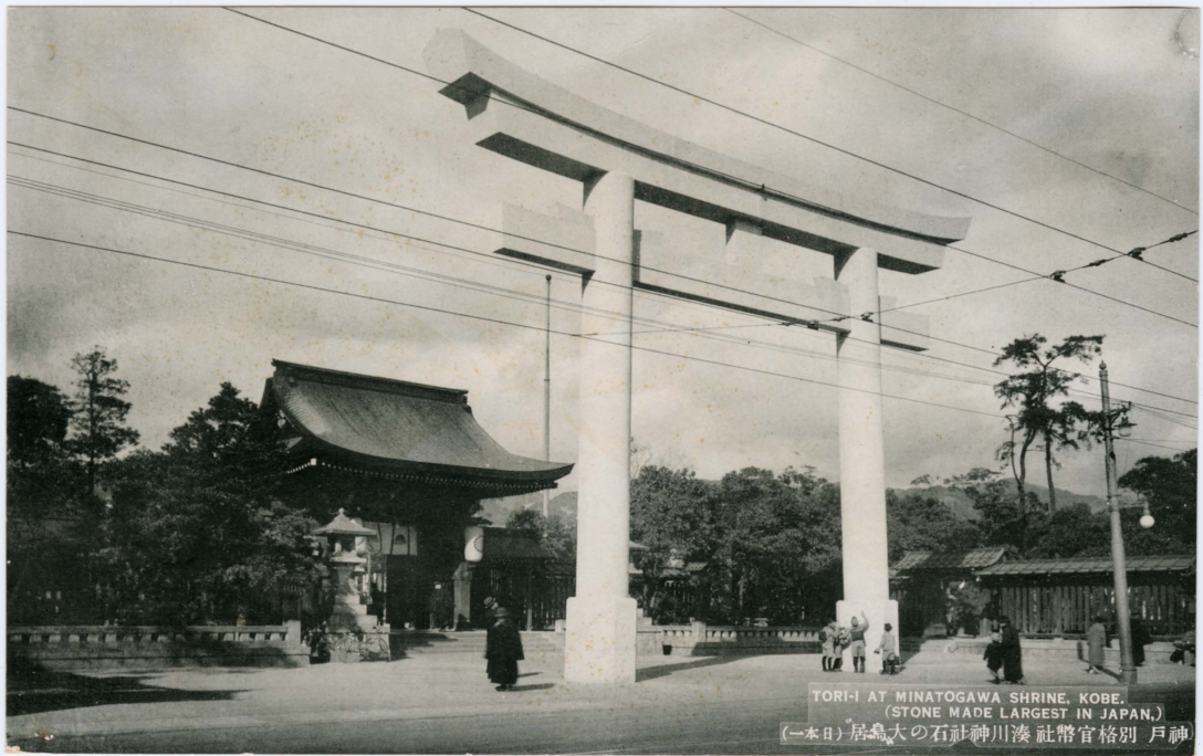
TORI-I AT MINATOGAWA SHRINE, KOBE. (STONE MADE LARGEST IN JAPAN.) (一本日)居島大の石社神川湊社幣官格別 戸神