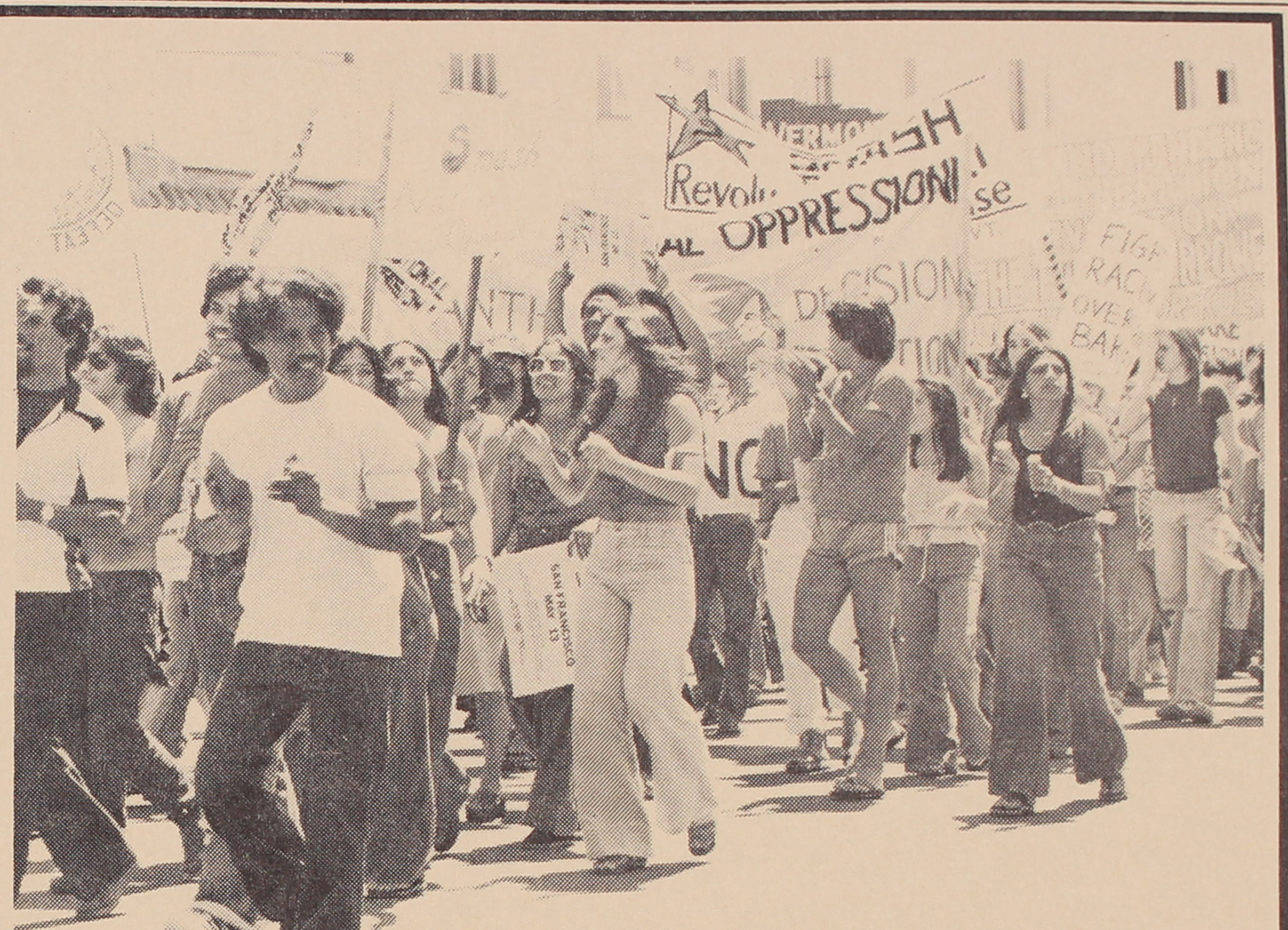
Week of Struggle, May 6-13, 1978.