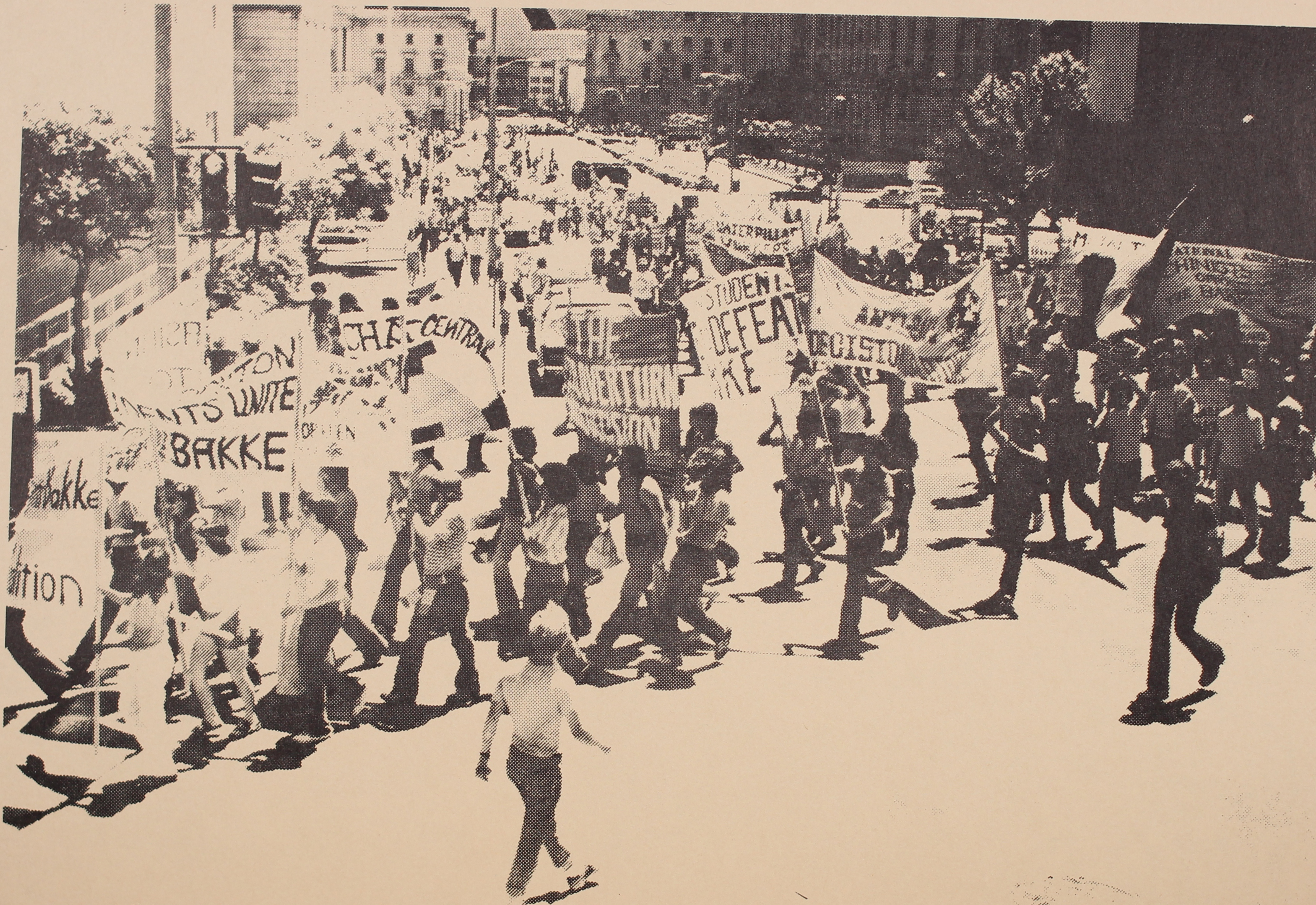
October 15, the ABDC's statewide mobilization and National Day of Solidarity. Over 4000 people of all nationalities unite and converge on the SF Federal Building. Colorful banners and spirited chants bring out the message: Smash the Bakke Decision, End National Oppression