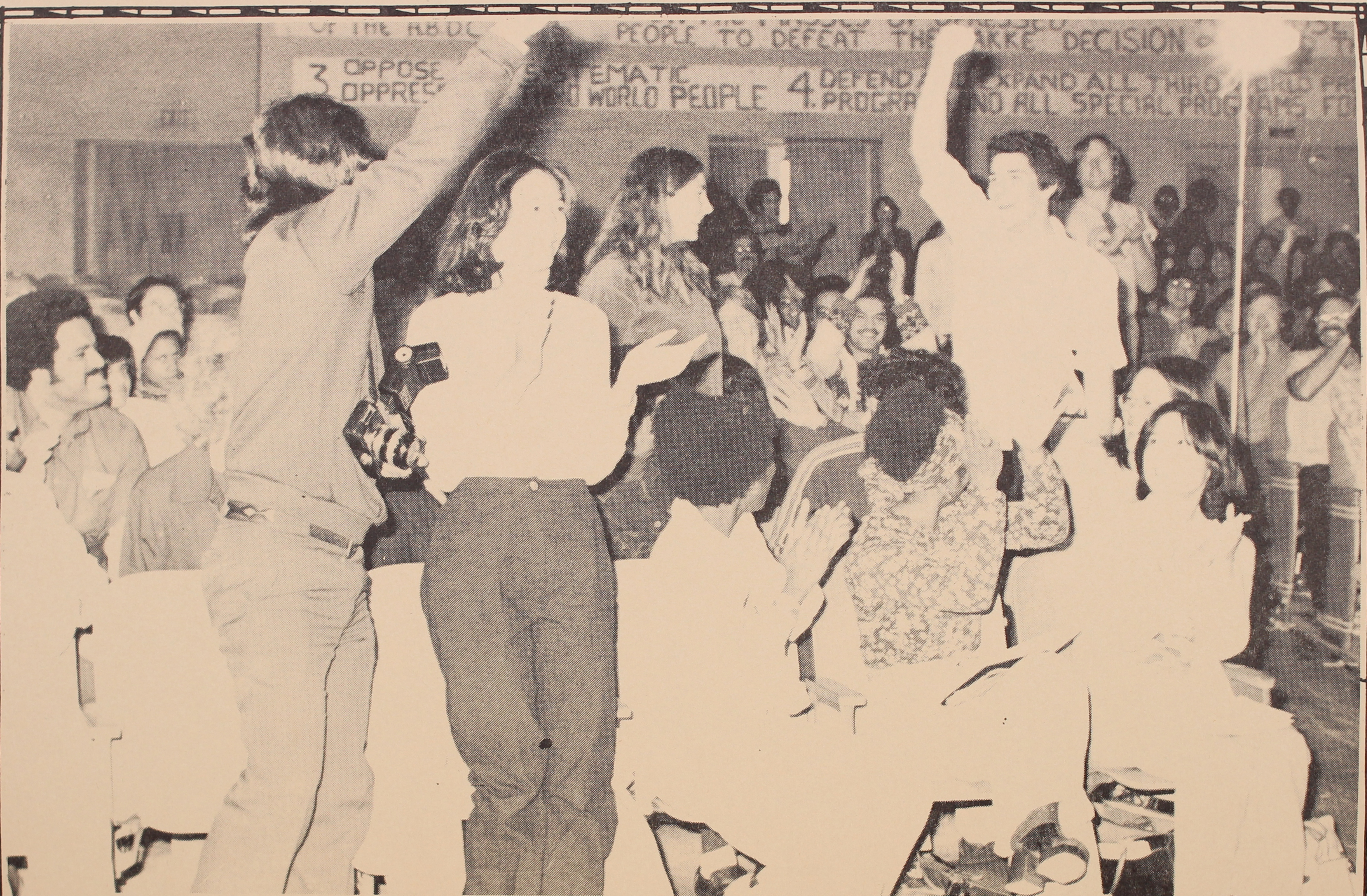
Los Angeles: ABDC National Conference, February, 1978. Over 650 people attended with 200 organizations represented. At this time, ABDC grew from a California statewide coalition to a nationwide coalition./ABDC Conferencia Nacional, Febrero, 1978. Mas de 650 personas asistieron con representacion de 200 organizaciones. En esta conferencia la ABDC crecio de una coalicion estatal a una coalicion nacional.