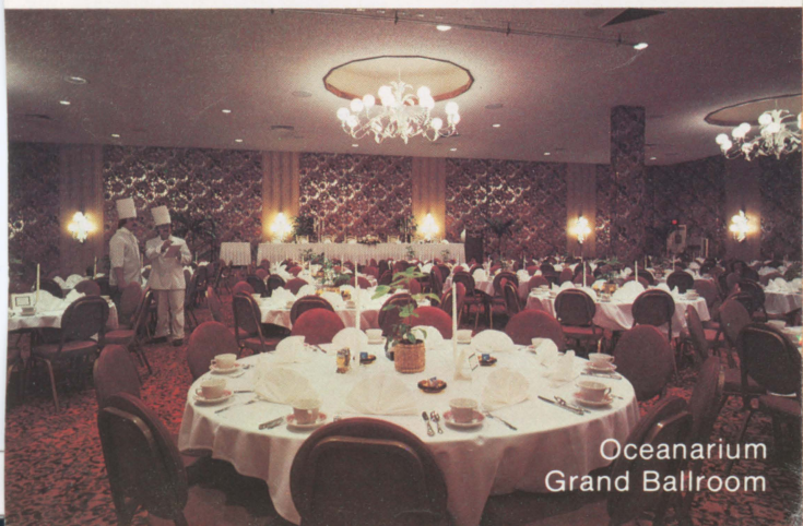
Oceanarium Grand Ballroom