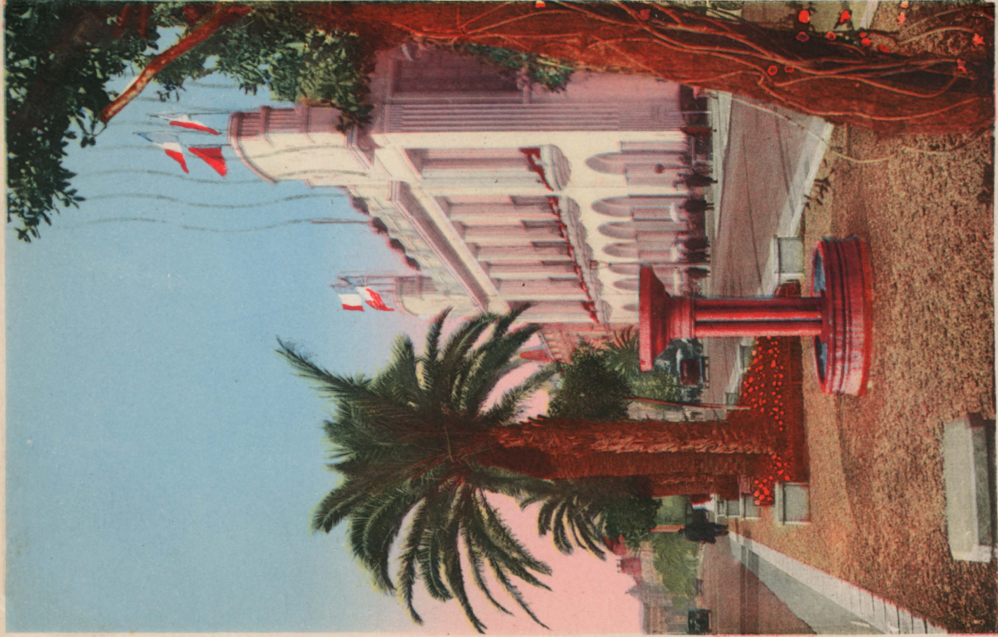
400. NICE — Le Palais de la Méditerranée