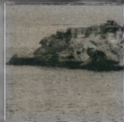
YAIYONIMA. Matsushima Park, The Japan Three Famous Views. 「日本三景」松島 舟も浪も鮮明な松のおほわれし。在城ヶ島