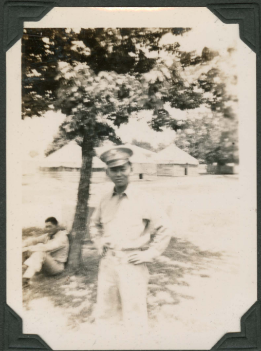
— ME — HQ. DET. STA. COMP. — JUNE, 1942 —