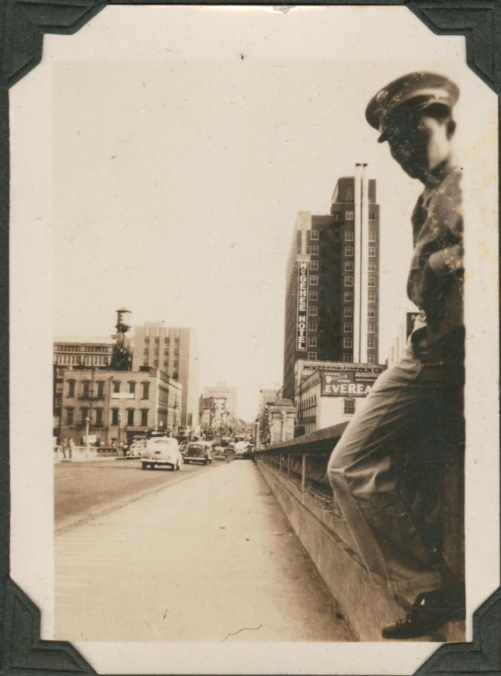
— ROCK — on MAIN ST. BRIDGE