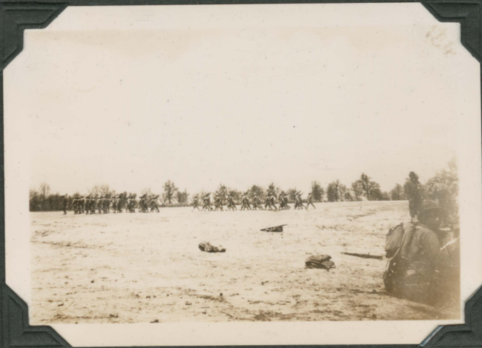
o ~~~~~ MARCHING ~~~~~ o