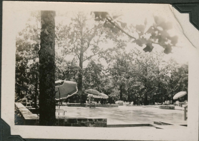
PATIO — SERVICE CLUB