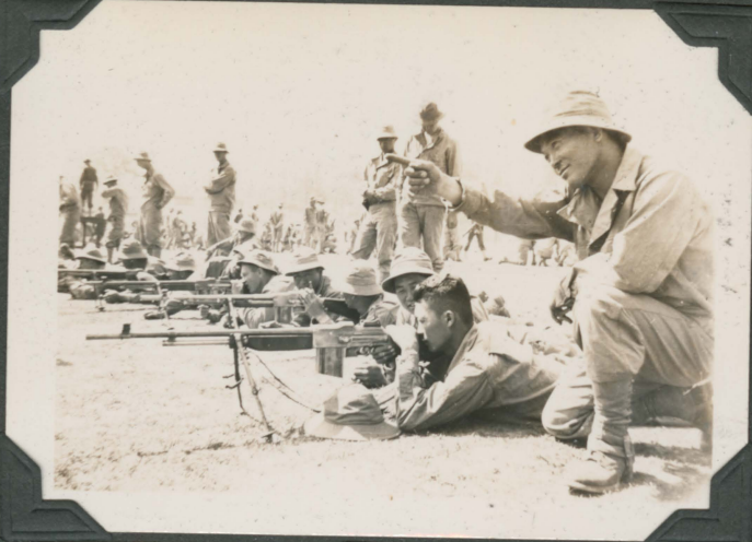
SUB MICHIN GUM