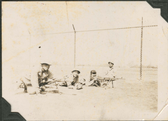
SHIZUOKA AND BUDDIES at B. A. R.