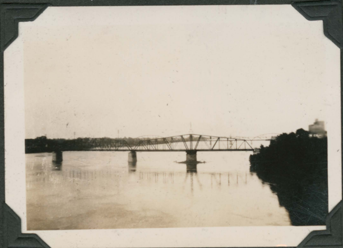
M.P. RAIL BRIDGE