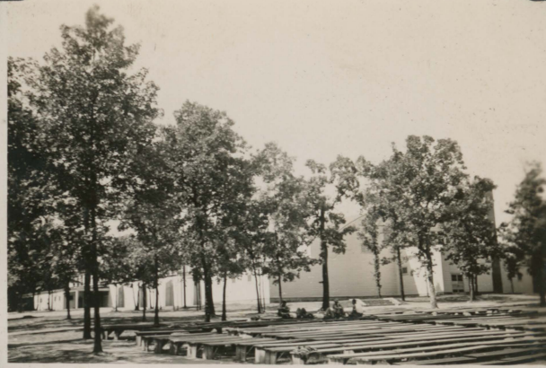
PT. SHIMOSE AT SOLDIER'S ARENA - AUG. '42