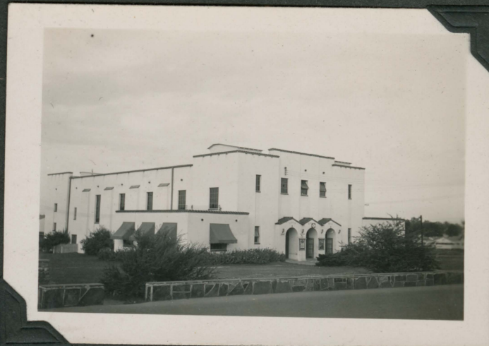
LOYD ENGLAND HALL