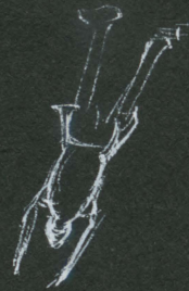
— SWIMMING POOL —