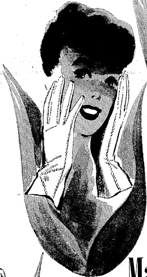
Below: Now is the time for the spanking freshness of a neatly gloved look. This pair, 2.50 Gloves, Street Floor