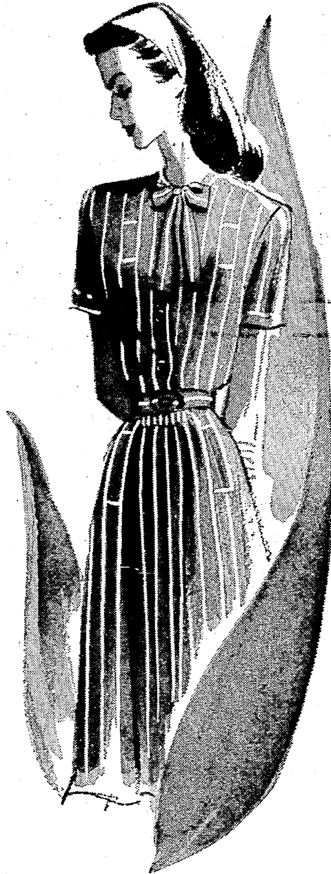
Below: A David Crystal casual in gold, cocoa, melon with white stripes. 12-16, 16.95 Piccadilly Shop, Third Floor

March is Cotton-Picking time in Fashion Center THE BON MARCHE where all Seattle shops