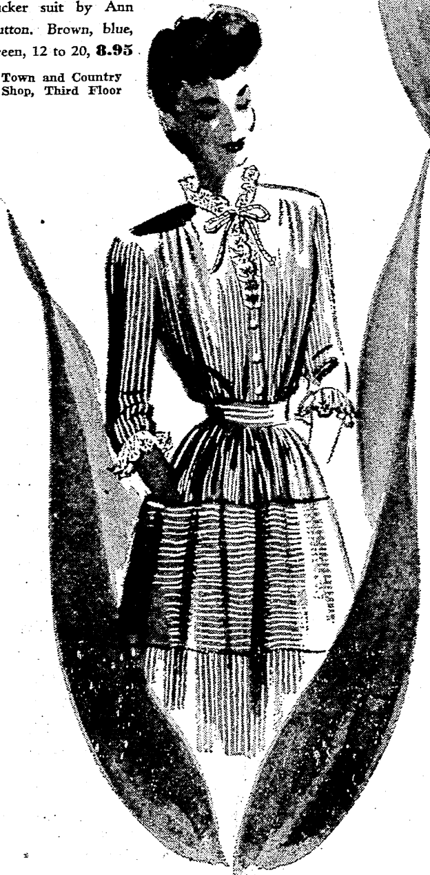
Right: Cotton for a queen! striped chambray in blue, green with white eyelet. 12-18. 12.95 Town and Country Shop, Third Floor