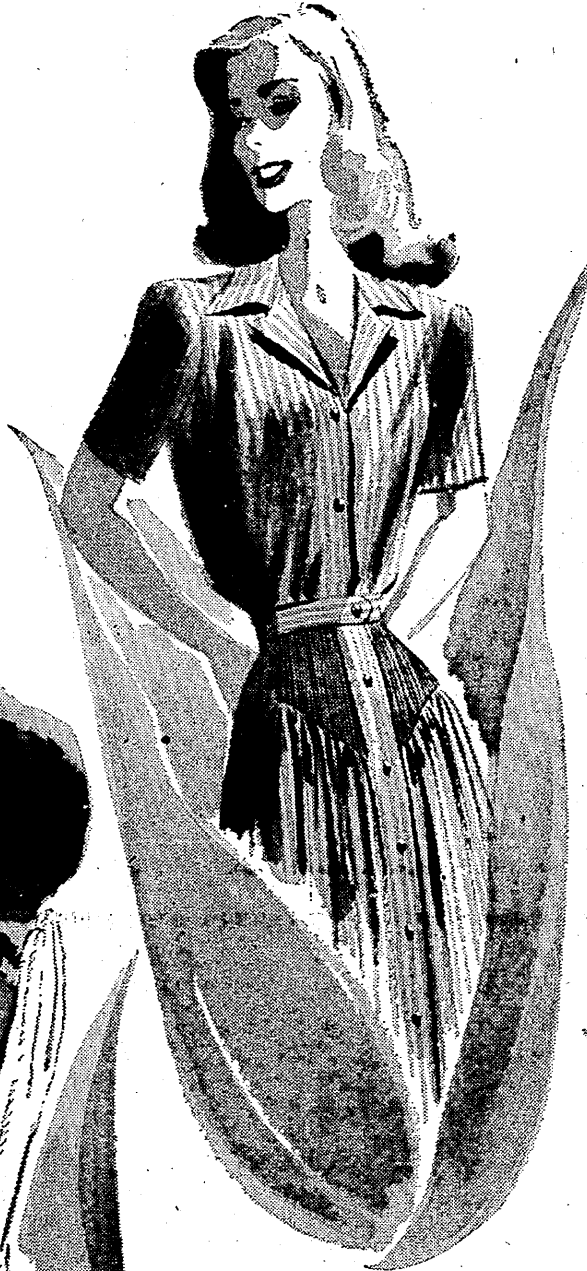
Above: David Crystal striped chambray in brown, red or blue. Sizes from 12 to 18, 16.95 Piccadilly Shop, Third Floor