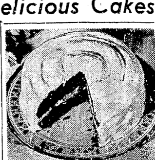
This delicious, tender chocolate layer cake is made with lard and calls for cocoa instead of chocolate. It is a real wartime treat, and worthy of a permanent place in any recipe file.

Bowl of flowers and cameo squares are worked in filet crochet and joined to create a beautiful tablecloth. Send the design number, your name, address, zone, and 11c to Dorothy Neighbors, The Seattle Times.