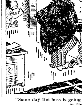
"Some day the boss is going to get into trouble, sticking pins in that map!"