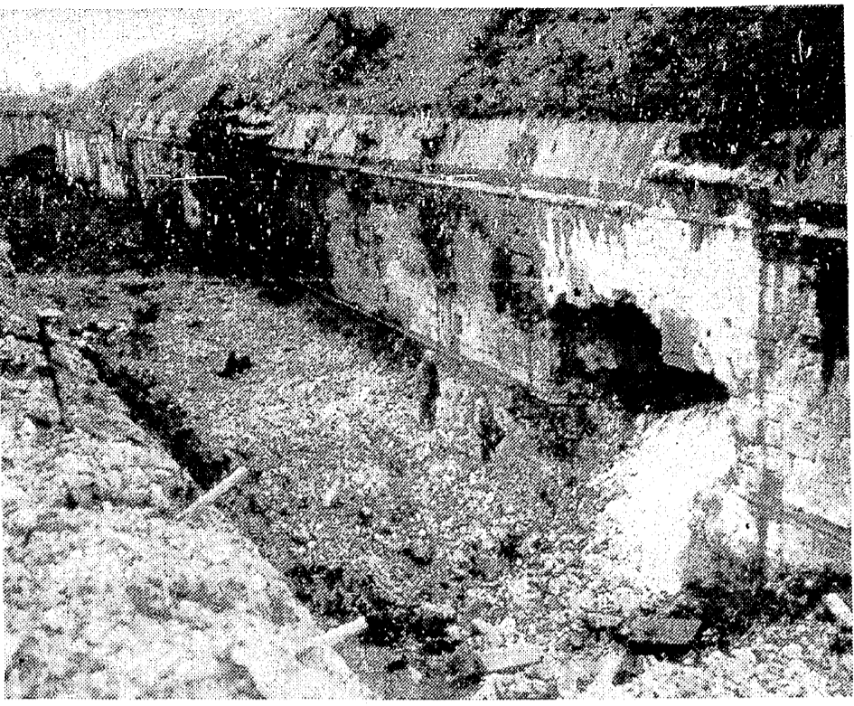
TNT IN TRUCK DID IT—Two American soldiers examine a hole in the wall of a German-held fort near Metz, France, after United States Army engineers had loaded a German half-truck with TNT and rolled it into the side of the structure. Eighty-two Germans surrendered to an American Infantry company after the blast.