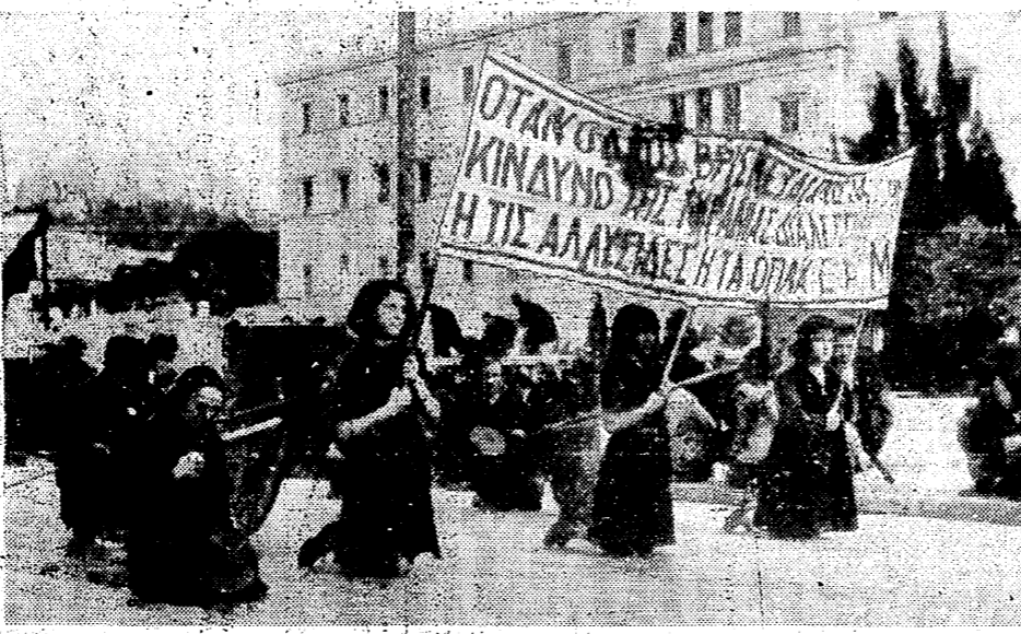
IN ATHENS—Led by a banner painted with blood of dead demonstrators, a funeral procession pauses opposite the old Royal Palace December 4, scene of a clash with police the day before, as a band plays a Russian revolutionary funeral march.