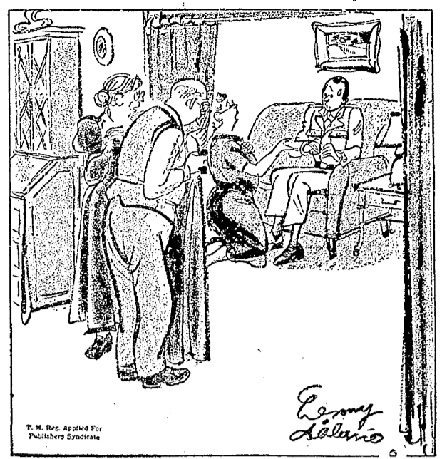
"Daughter's a little obvious, don't you think?"