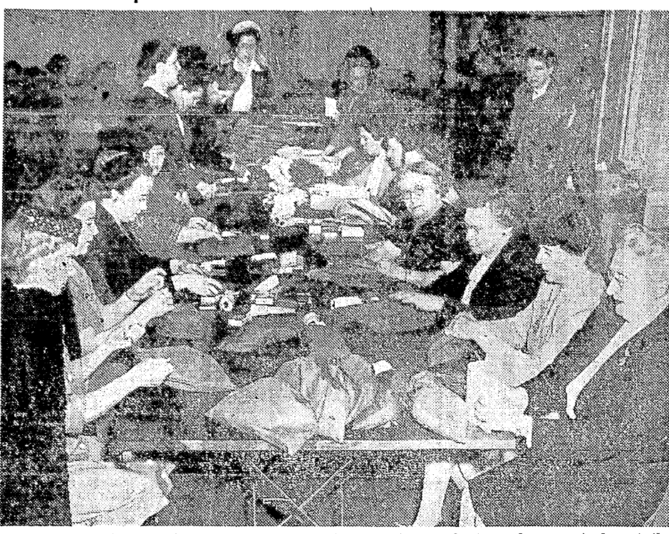
On the final lap of a gigantic job, members of six women's organizations, shown yesterday at the Red Cross Chapter House as they neared the end of their job of filling 25,000 kit bags supplied by the National Red Cross for service men. The kits, each containing 12 articles ranging from razor blades to books, will be distributed to special service officers in this region.