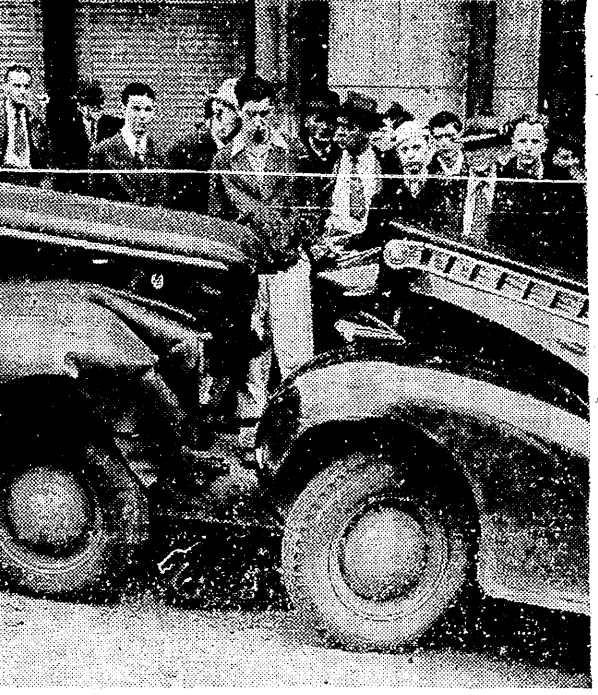
A truck loaded with vegetables slipped its brakes in James Street about 3:45 o'clock yesterday afternoon and roared across busy Fourth Avenue, crashing against the radiator of a parked automobile beside the County-City Building, with the results shown here. The parked automobile was pushed back against another parked machine, damaging it also.