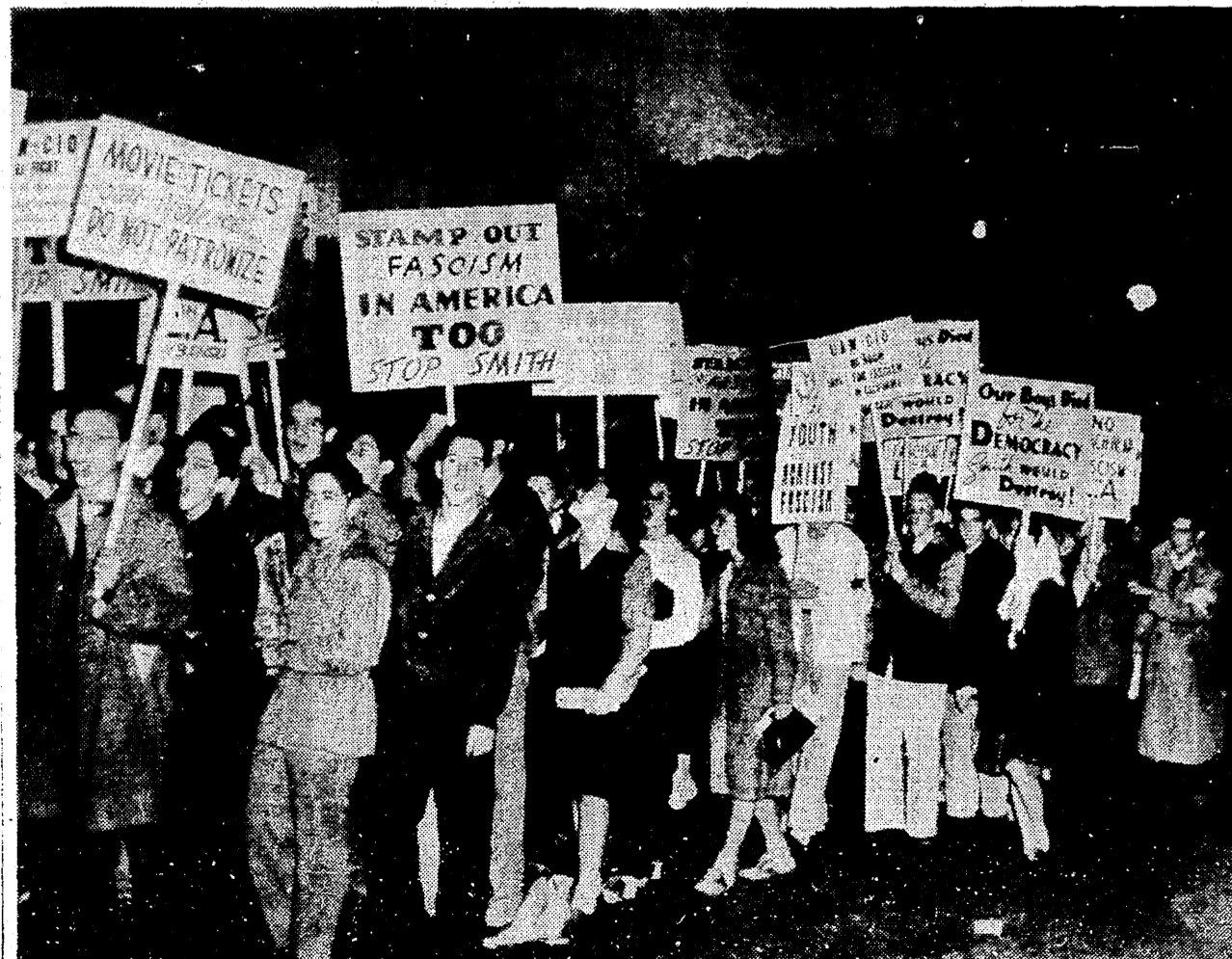
IN LOS ANGELES LAST NIGHT—These singing 'teen-age youngsters were among the estimated 8,000 pickets who paraded around Polytechnic High School in protest against an address there by Gerald L. K. Smith in behalf of California's ham 'n' eggs pension plan, which has been the subject of much controversy in California.

LOS ANGELES, Oct. 18.—(AP)—White Gerald L. K. Smith addressed a "Ham 'n' Eggs" pension plan meeting and predicted war with Russia by 1950, more than 8,000 high-school pupils and labor-union pickets paraded last night protesting his use of a school building for his speech.