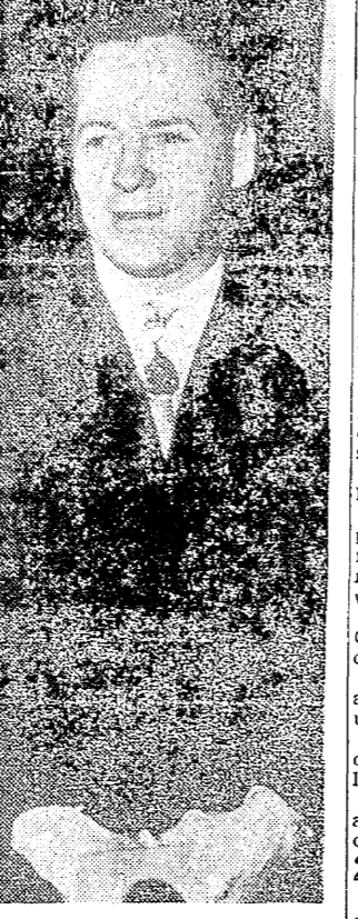
GANNA WALSKA and THEOS BERNARD Singer and husband in divorce court

SANTA BARBARA, Calif., July 13.—(AP)—Handsome Theos Bernard, 36 years old, self-styled reincarnation of a Buddhist saint, has agreed to leave the "Penthouse of the Gods" mountain home of his wife, Mme. Ganna Walska, 53, and accept $1,500 temporary alimony. He is her sixth husband.