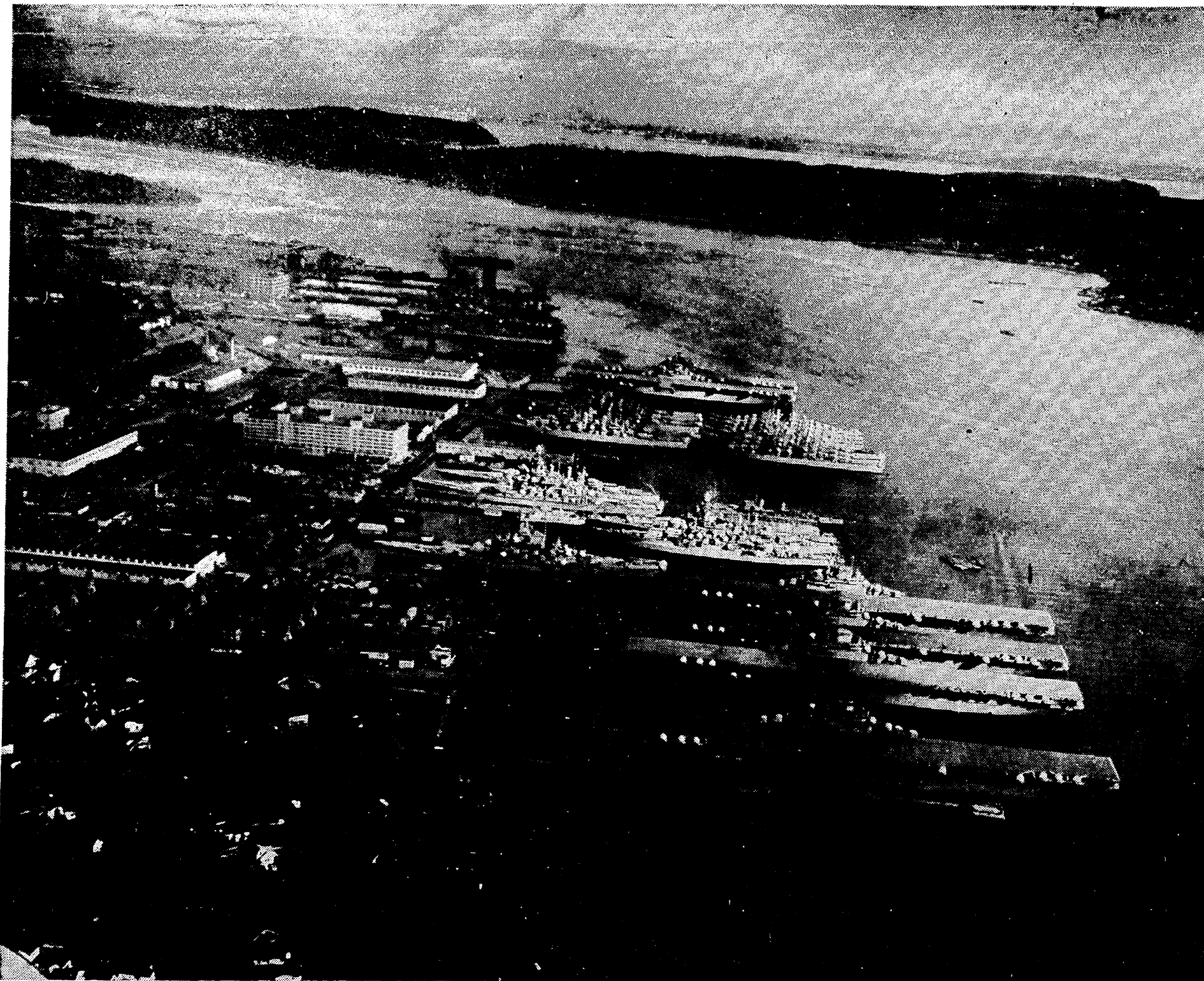
BREMERTON 'MOTHBALL FLEET': These fighting ships lay in the Bremerton Naval Shipyard today while a controversy swirled in Washington, D. C., regarding charges that the Navy has not

been given a fair deal in military unification. Beam to beam in the foreground are four Essex-class aircraft carriers. Five battleships are next in the nest; then cruisers and destroyers, and two carriers.