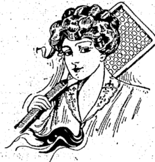
The Electra Rolling Collar, illustrated above, is one of the most popular of this season's neckwear novelties. It is shown in plain linen at 60c and in embroidered styles at 85c.

Jabots Embroidered with Colored French Knots and finished with Valenciennes edge and insertion, 25c each.