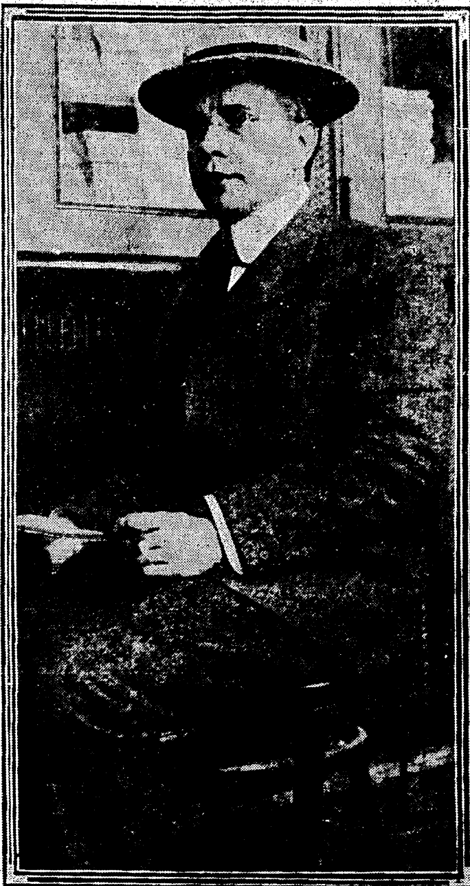
Slayer of Stanford White as He Looks Today After Years in Hospital for Criminal Insane

Price 1c. On News Stands, Boats, Trains, 5c.