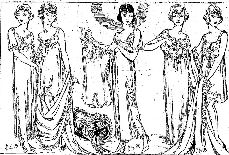
$4.95 $5.95 $6.95

Put up in attractive Christmas boxes if you wish. UPPER MAIN FLOOR.