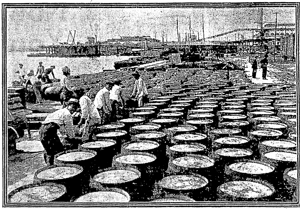
Coolies Loading Strike-Bound Treasure.

Non-union Chinese coolies moving the first shipment of American whiskey to reach Havana, Cuba, in the rush from this country to avoid confiscation. A strike of the stevedores at Havana threatened to prevent ships from unloading their cargoes, but whiskey vessels, in haste to return for more cargoes, left whiskey on the docks, from which it was removed to warehouses.