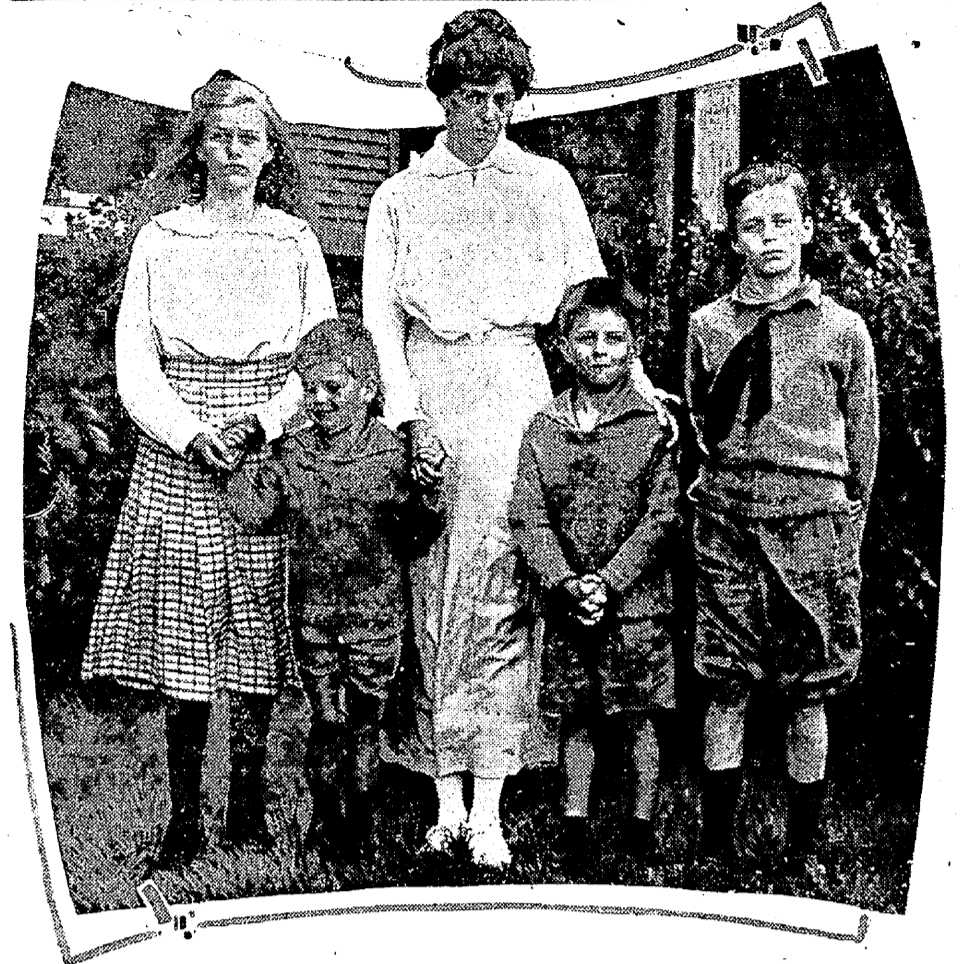
Family of Democratic Vice Presidential Nominee. This picture shows Mrs. Franklin D. Roosevelt, wife of the Democratic vice presidential nominee, with four of her five children, photographed at the Roosevelt summer home at Campello, New Brunswick, Canada. The children from left to right are: Anna, John, Franklin, Jr. and Elliott.