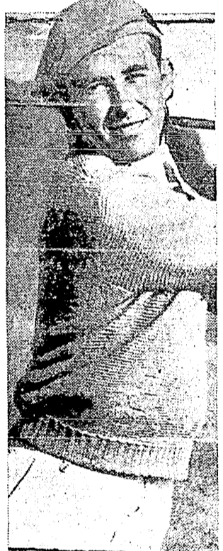
Paul Runyan, above, defeated MacDonald Smith, Horton Smith, Denny Shute and other stars of golf, to win the Pasadena open tournament yesterday.