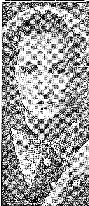
This is Miss Marlene Dietrich, film star, who has decided she isn't at odds with the Nazi-controlled Germany of her birth.