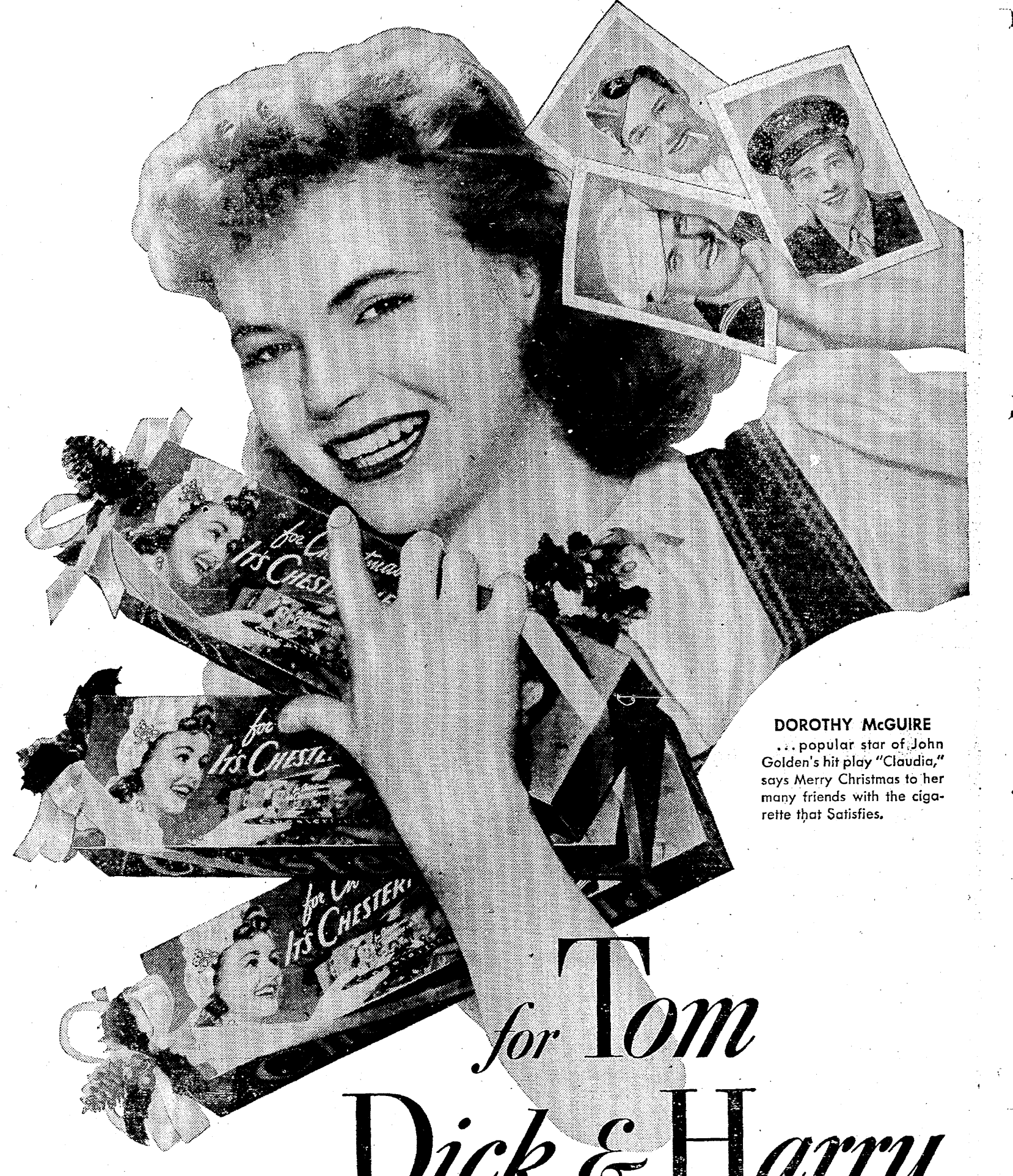
DOROTHY MCGUIRE ... popular star of John Golden's hit play "Claudia," says Merry Christmas to her many friends with the cigarette that Satisfies.

Pinex is a special compound of proven ingredients, in concentrated form, a most reliable soothing agent for throat and bronchial membranes. Just try it, and if not satisfied, your money will be refunded.