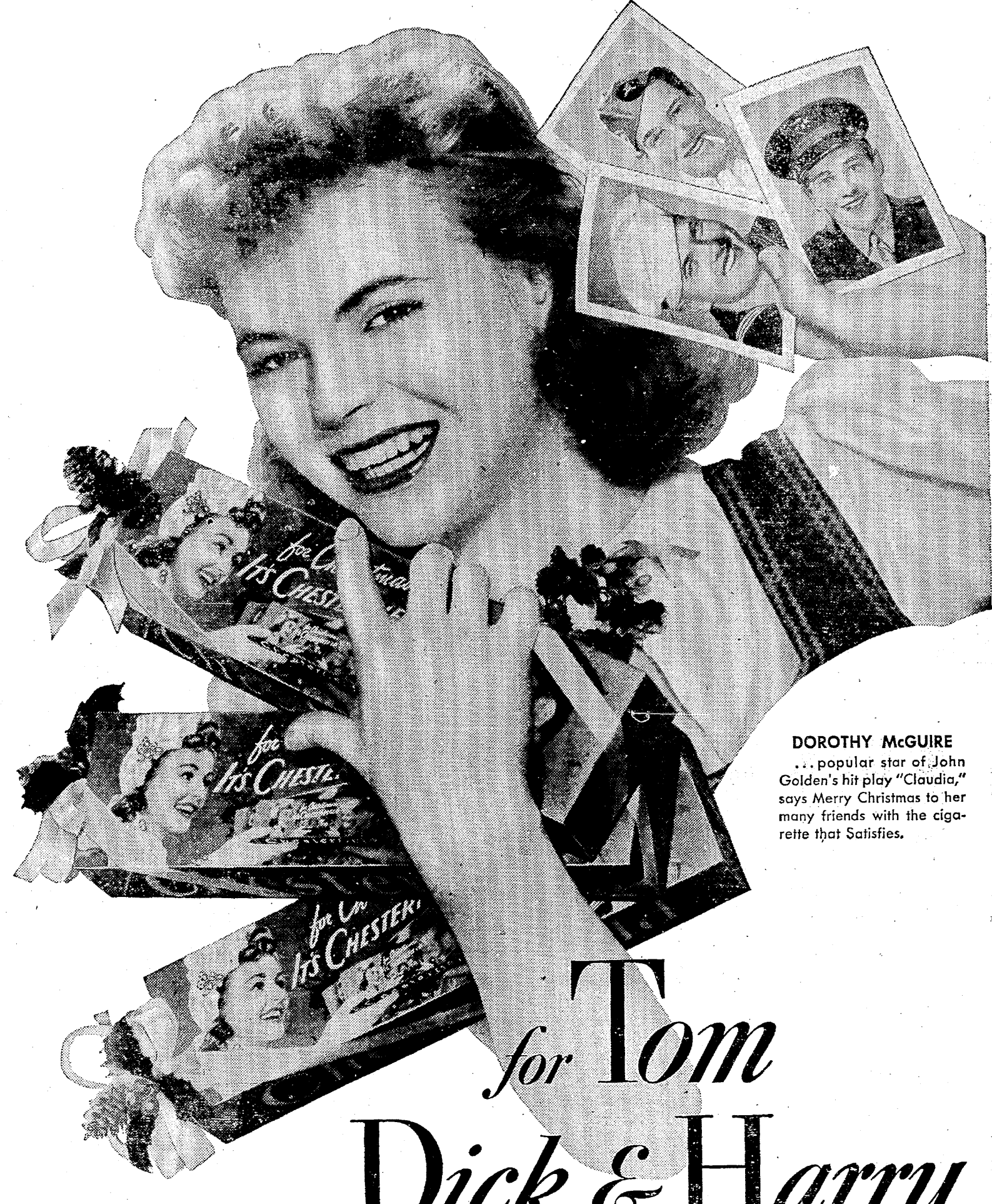
DOROTHY MCGUIRE ... popular star of John Golden's hit play "Claudia," says Merry Christmas to her many friends with the cigarette that Satisfies.