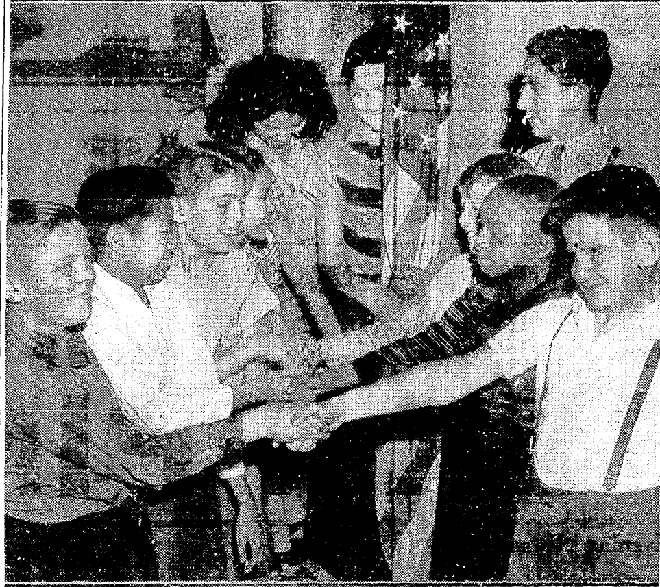
The international character of the war—as well as the international character of the Bailey Gatzert School—is illustrated in this photograph of the sixth-grade color guard at the school. Every child shown here in a handclasp of friendship represents the racial stock of some nation at war. Among these are Japanese, Chinese, Filipino, Dutch, Greek, Jewish and Finnish.