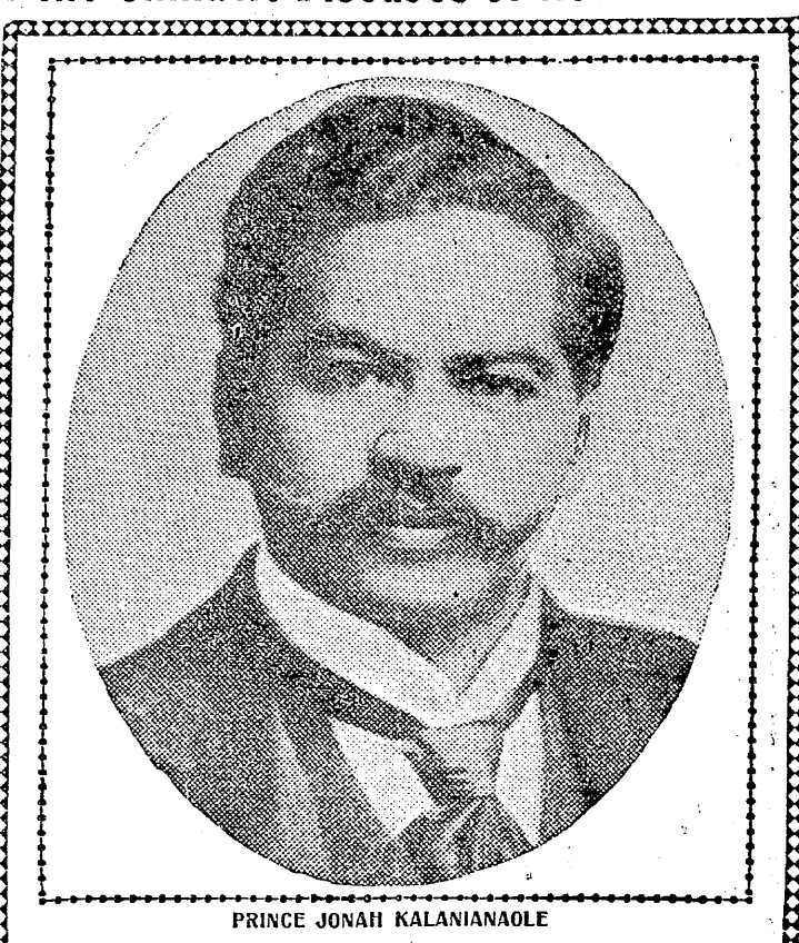
PRINCE JONAH KALANIANA'OLE

Nine cases of consumption out of ten occur in this way: People catch cold. The cold is not properly cured, and they quickly catch