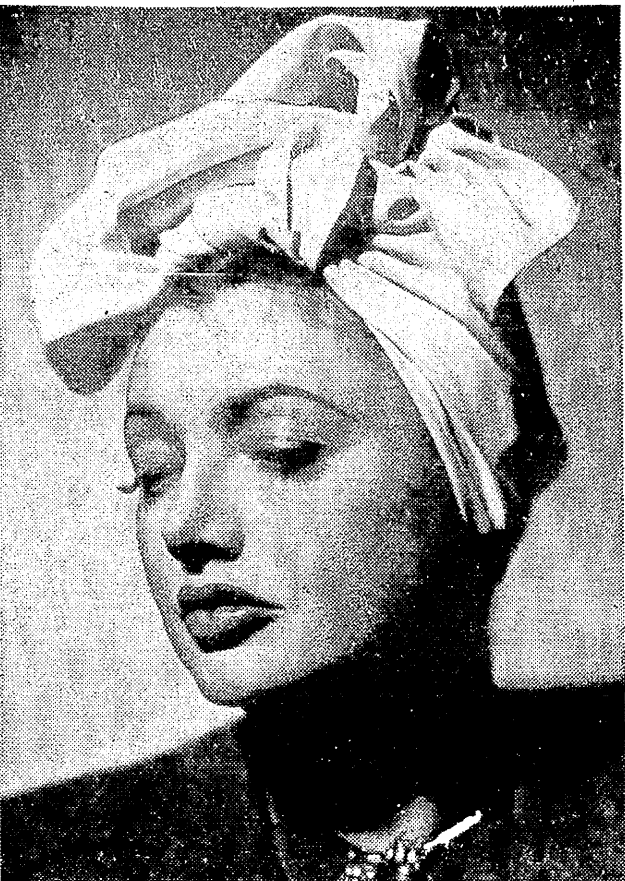
Katharine Cornell, who will present her new play, "Rose Burke," at the Metropolitan tomorrow night. The engagement is for four days only.