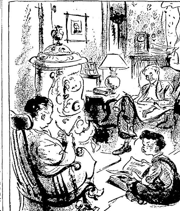
"I can't get a thing out of grandpa about the time he fought in the Philippines. He just says it was pretty warm and rained a lot!"