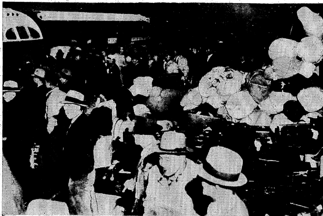
IN LOS ANGELES YESTERDAY Beginning the nation's greatest forced migration, these Japanese boarded busses which transported them to Owens Valley, 235 miles north of Los Angeles, where the government's first alien reception center is under construction. The nearly one hundred Japanese who left yesterday were skilled workers who will help prepare the camp for thousands of others to arrive later.