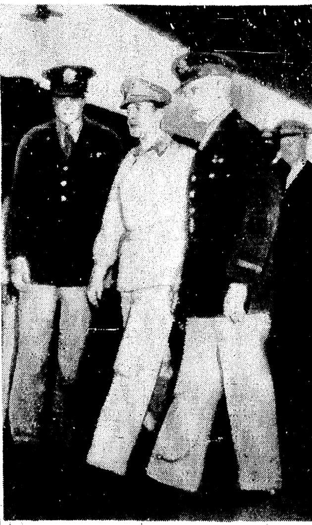
IN MELBOURNE As Gen. Douglas M'Arthur (center), arrived in Melbourne from Adelaide, Australia, yesterday he left the railroad station with his deputy supreme commander, Lieut. Gen. George H. Brett (right). General Brett, expert on aerial warfare, will assist General MacArthur in mapping his airplane drives against the Japs. This picture was radioed from Melbourne to London and from London to New York.