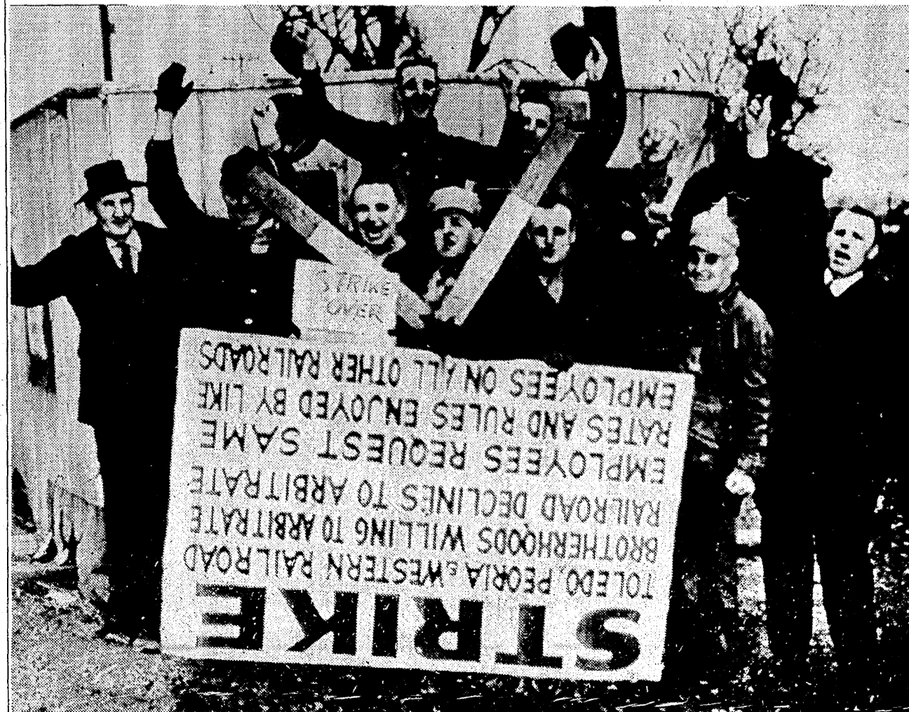
IN PEORIA, ILL., YESTERDAY Pickets in front of a shanty near the main entrance to the railroad yards cheered the verdict of President Roosevelt ordering the government to take over the T. F. & W. Railroad. The up-side-down sign was an indication the strike was over and the "V" of two-by-fours was a "V" for victory.