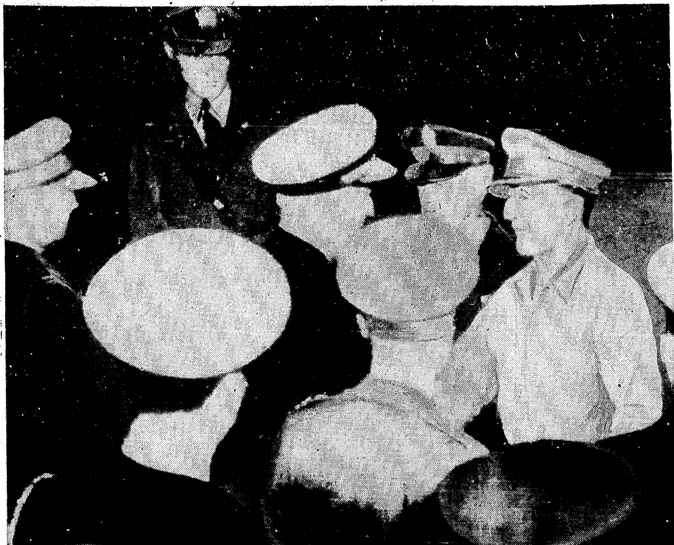
IN MELBOURNE YESTERDAY Gen. Douglas MacArthur (right, light uniform), was greeted by officers representing United Nations forces as he arrived in Melbourne from Adelaide, Australia. This picture was radioed from Melbourne to London and from London to New York yesterday.