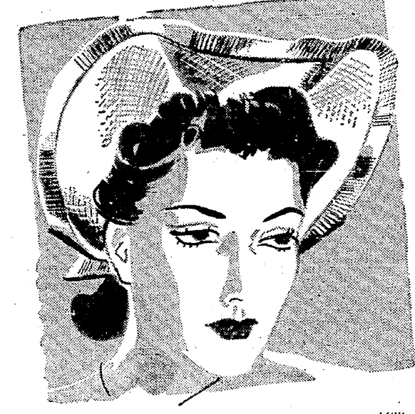
• Millinery . . . Fourth Floor

The hats that men love . . . romantic face shading brims that give you great charm. Choose YOURS in smooth straw, in dramatic black, or in white that sheds soft, flattering light onto your face. Others . . . 7.50 to 12.00.