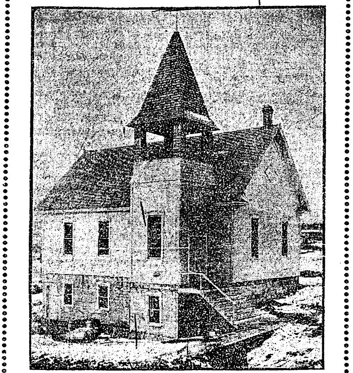
LAKESIDE M. E. CHURCH.

Limitation Impracticable. "In my judgment we are not excused if we build any battleship inferior to those now being built by other nations. I should be glad if a limitation could be agreed upon as to the size of battleships hereafter to be built.