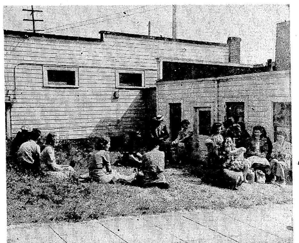
Three hours before the rationing board opened at North 73rd Street and Aurora Avenue yesterday there were this many men and women sprawled on the lawn or seated on appleboxes and other makeshift chairs waiting for sugar applications to be accepted at 1 o'clock.