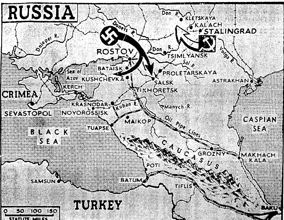
OFFENSIVE FANS OUT—German forces (black arrows) fanned out below the Lower Don River today, pressing toward the Sea of Azov below Bataisk...

"The night operation was particularly noteworthy in view of the fact that this was the first time any Japanese planes had been shot down over China at night."