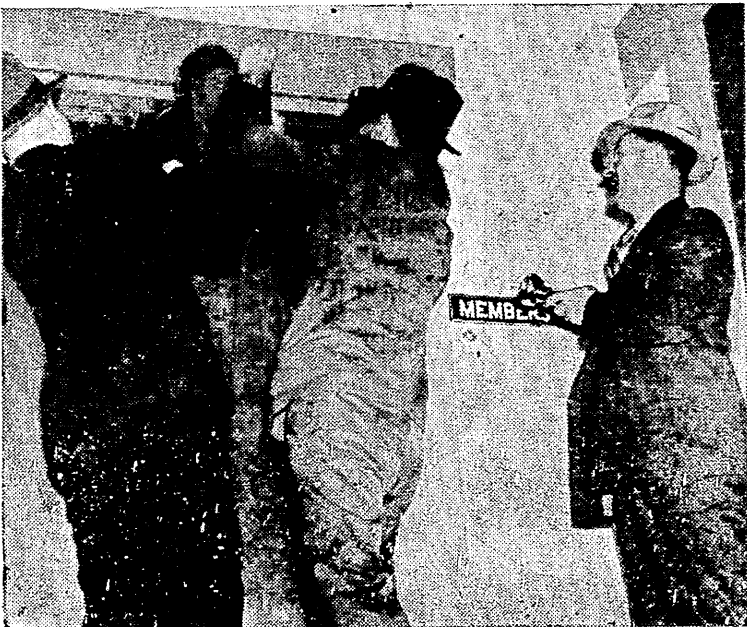
MEMBERS ONLY doesn't apply to detectives smashing three steel reinforced doors to reach the interior of the Little Tokyo club where they sought and found a billiard cue murder weapon.

Thus the Black Dragon is believed to have spread a trail of death and terror through Jap colonies in California. Federal authorities are keeping a watchful eye open, ready to chop its vicious tentacles at the least sign of recurrent life. They are determined that never again will Japan's dread secret society reach across the ocean to drain American dollars for its nefarious activities.