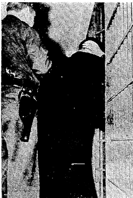
ALLERGIC to photographers was this Jap gambling lord, during trial for alleged murder of a Lodi, Calif., rancher.