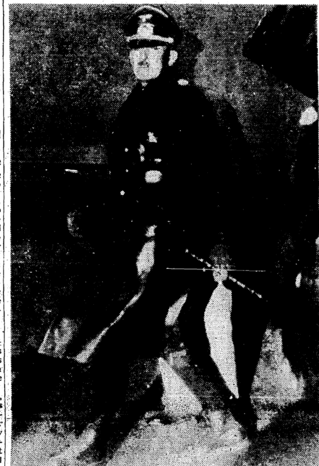
COL. GEN. JURGEN VON ARNIM He'll see no more battlefields for a while.

Chicago Daily News Foreign Service LONDON, May 17.—(Special Cable)—Direct from Tunisia by way of Gibraltar, Col. Gen. Jurgen von Arnim, surrendered German commander of Tunisia, arrived in London yesterday and was handed over to the War Office by the Royal Air Force at an air field in the south of England. Nothing can be said about others who may have accompanied him but it is indicated that he will be treated in captivity with the courtesies due his rank and will receive the same pay as he would in the German army, which is approximately $10,500 annually. (Copyright, 1943.)