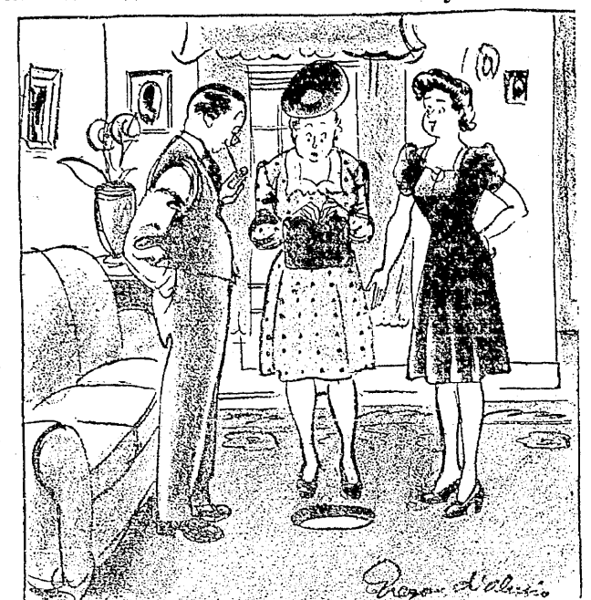
"The young folks have a rumpus room downstairs, and we sort of like to keep an eye on them."