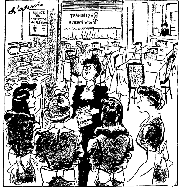
"Now wear your best smiles and flirt a little with the customers today. We haven't any meat!"