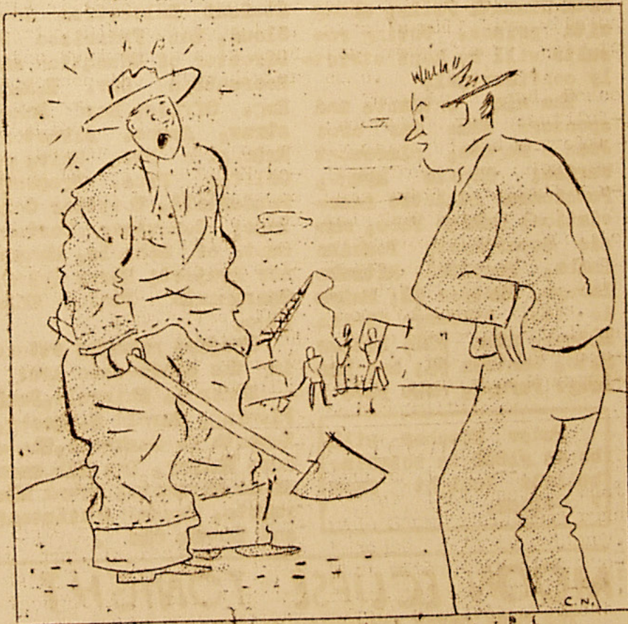
"G-I. THINK IT'S LITTLE TOO BIG"

But that wasn't what made Sammy run. Sammy runs because he's in a hurry. What with girls at a premium and the ratio--oh, golly, 3 wolves to a cabbage.