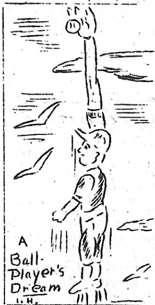
A Ball-Player's Dream I.H.

All tennis enthusiasts are requested to meet in Room 408 at 8:30 tonight, June 11.