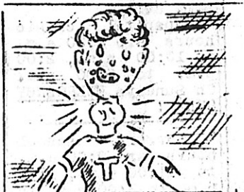
"But I couldn't see that Ball -- Mom." I.H.