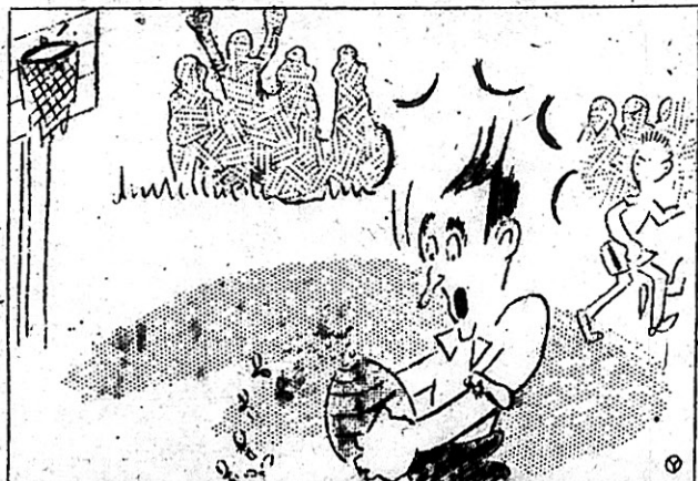
"WHERE DID THIS COME FROM?!?"

The amount raised in the Granada center was more than three times that of any other center.