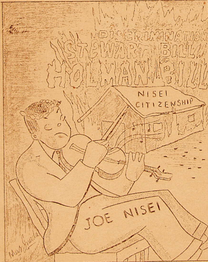
WHILE ROME BURNS.....