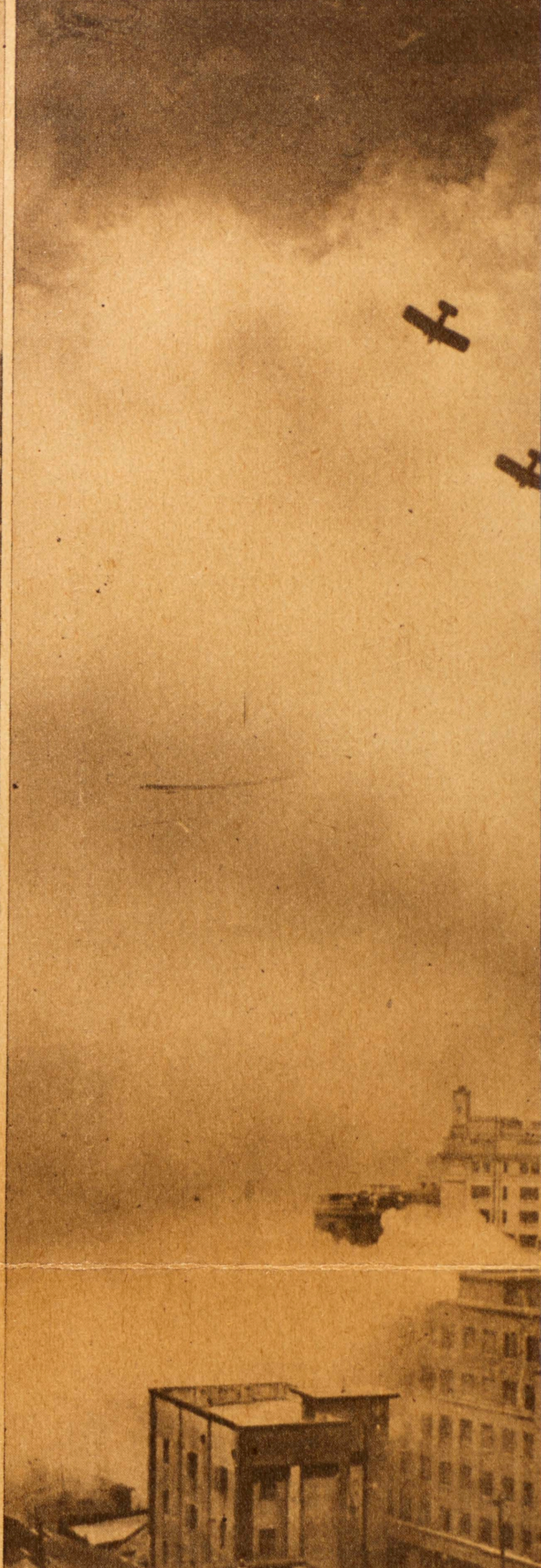
An anti-air raid drill on an unprecedented scale was held in the Kanto region with Tokyo as centre on August 10 and 11. The picture shows thick smoke screens protecting the Nihonbashi neighbourhood, Tokyo, from an attack of 'enemy' planes.