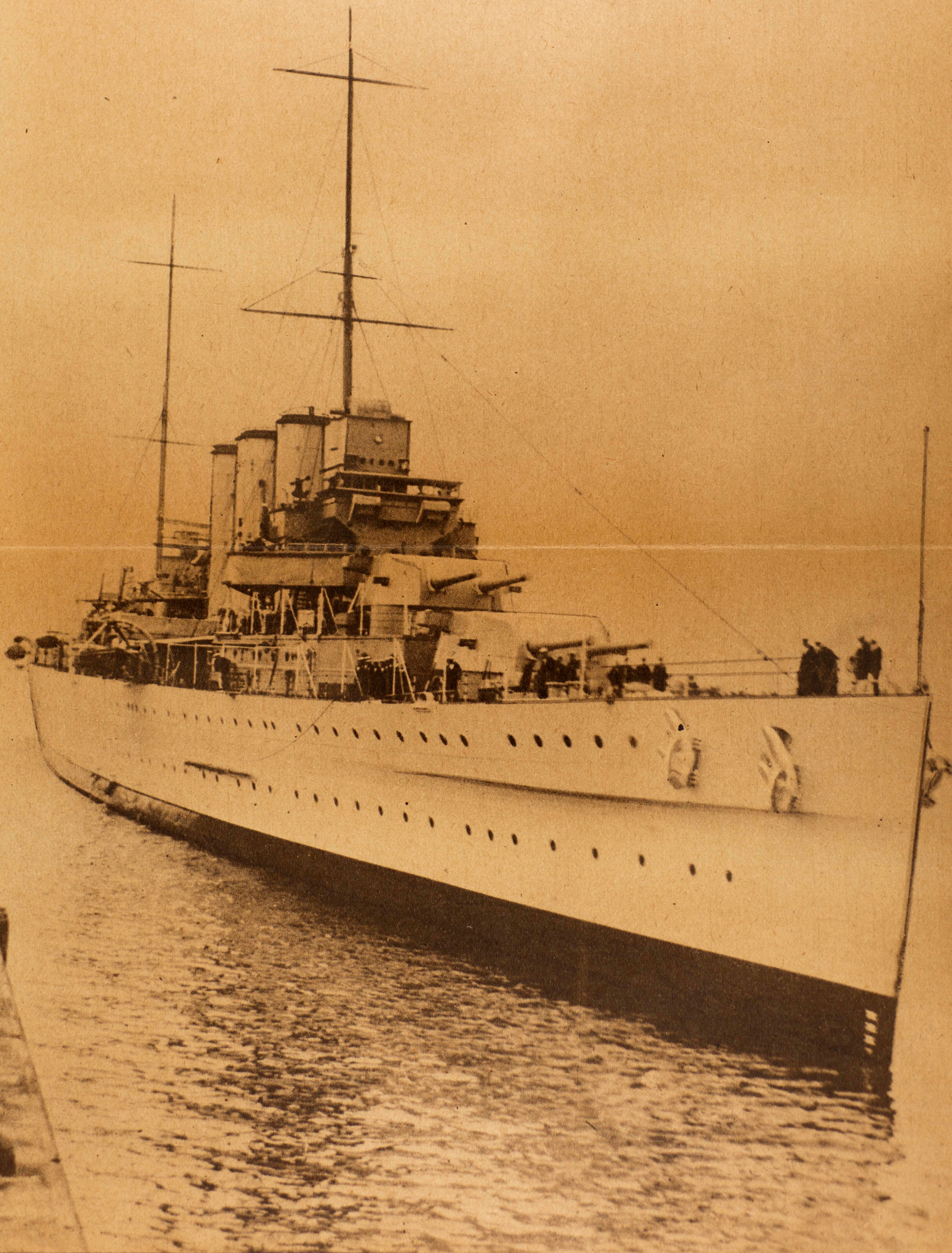
The flagship Kent of the British Squadron,