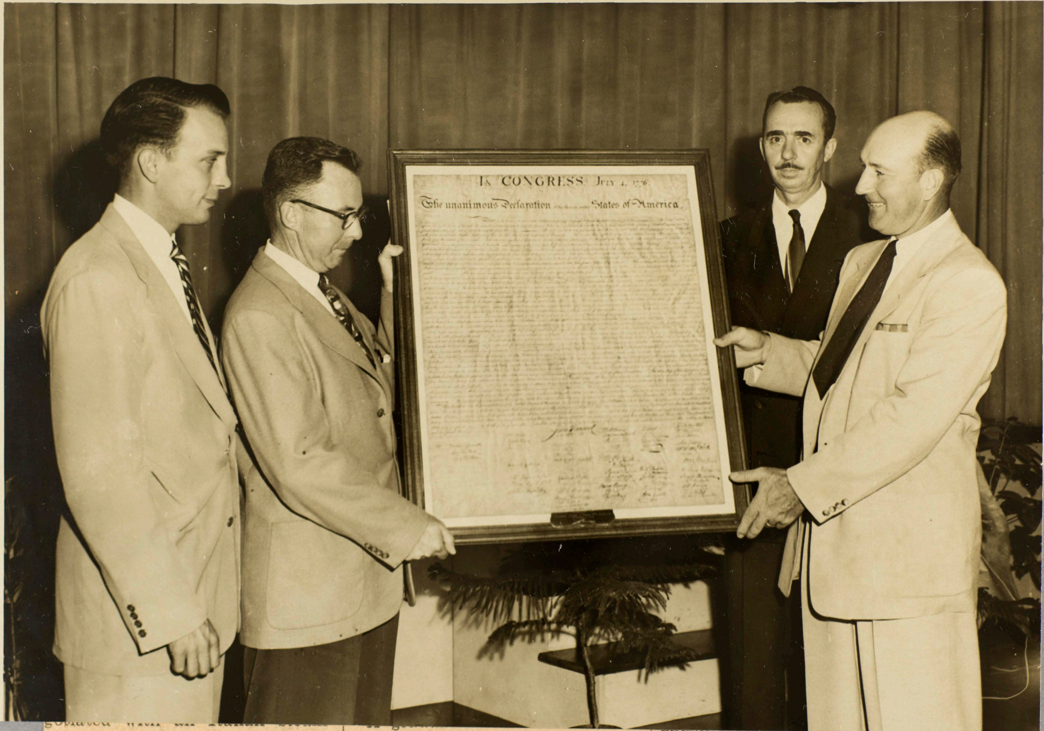
G... was ... ship line ... he received his DDS degree ...