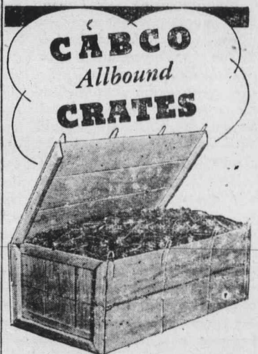
Cabco Size No. 1 an even bushel capacity

Other uses of walnut shells are in the manufacture of explosives and plastics.