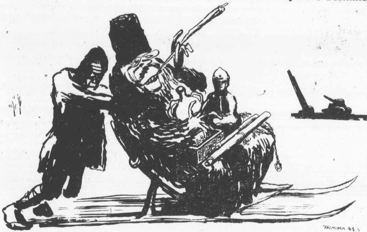
East Asia Co-Prosperity Sphere, Manchurian Section